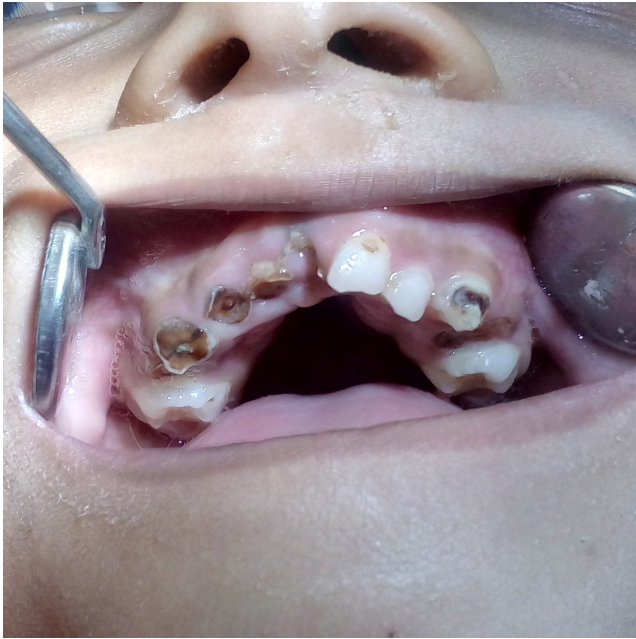
Fig. 4. Decayed and malaligned teeth

was high with a narrow and deep palate. He had a negative history of thumb sucking. Crowding was present in the mandibular teeth. The maxilla was hypoplastic. Besides, the child had congenital heart disease with aortic regurgitation.