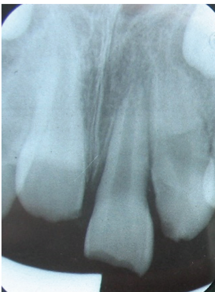
Fig. 1. Initial periapical radiograph revealing intrusion of tooth 11 and fracture of tooth 21

After 4 weeks, spontaneous re-eruption of the maxillary right central incisor could be identified (5.5 mm). The patient was referred to the orthodontist for orthodontic repositioning by extrusion. At 9 months after the trauma, clinical and radiographic examinations revealed further progress of extrusion for the upper right central incisor amounting to 9 mm and complete root development with closure of the apical foramen and apposition of the root dentin. Due to pulp vitality loss, endodontic therapy of