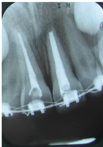
Fig. 2. Periapical radiograph after filling the root canal of tooth 11