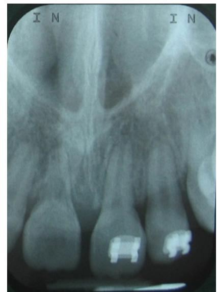
Fig. 6. Periapical radiograph 22 months following trauma showing inflammatory root resorption