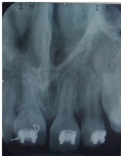
Fig. 5. Radiograph before surgical procedure showing the disappearance of periodontal space around tooth 11