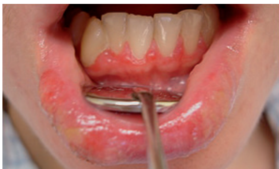
Fig. 1. Erosive lichen planus manifestations and desquamative gingivitis