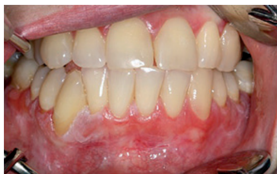
Fig. 5. Lichen planus manifestations