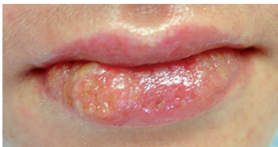
Fig. 2. Malignant transformation of oral lichen planus